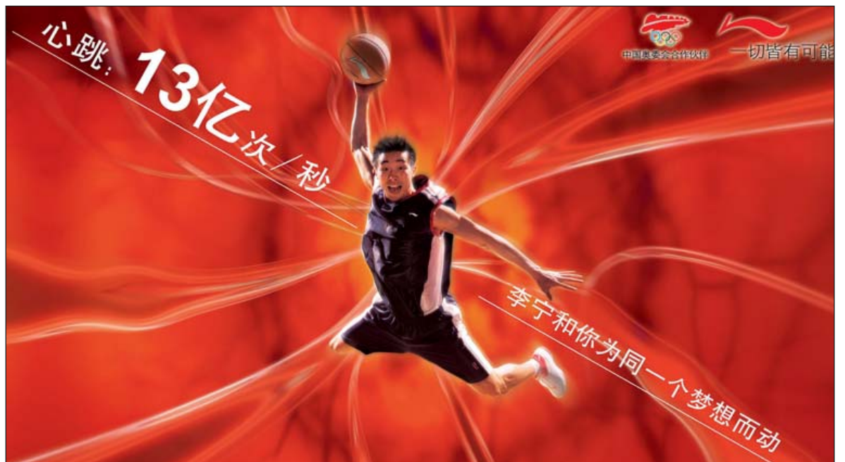
A perceived global presence and affordable products are highly appealing to younger Chinese consumers.