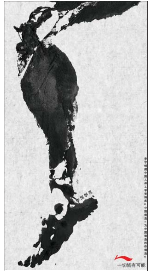
Once courted, Chinese consumers are fiercely loyal.

‘Local brands do more premiums. The reason is that it tends to have a more immediate result.’